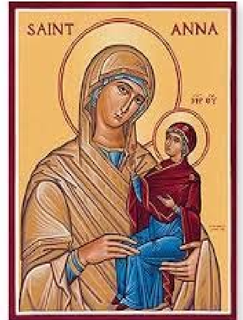
DORMITION OF SAINT ANNE July 25

Sick Calls: Anytime Baptisms and Marriages: By Appointment