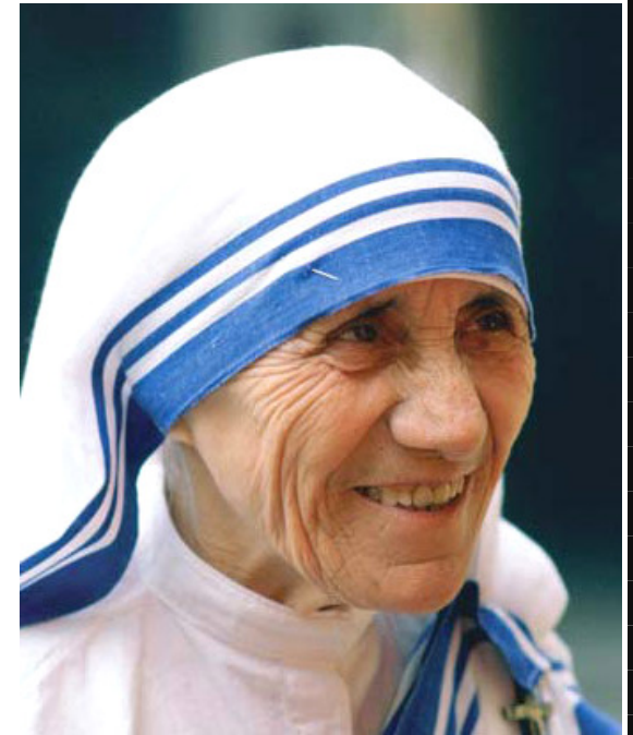
Saint Mother Teresa