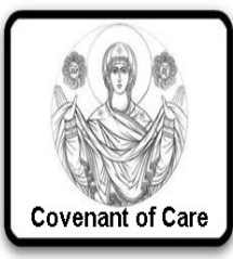
Covenant of Care

There will be a perogy bee on Feb. 26 and 27 starting at 9:00 a.m. Come one, come all!