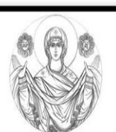
Covenant of Care