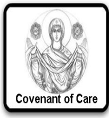
Covenant of Care