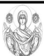
Covenant of Care

We are all wading through uncharted waters as we return to our worship services. If we all do our part, we can return to some sort of normalcy over the coming weeks. Thank you for your patience and cooperation.