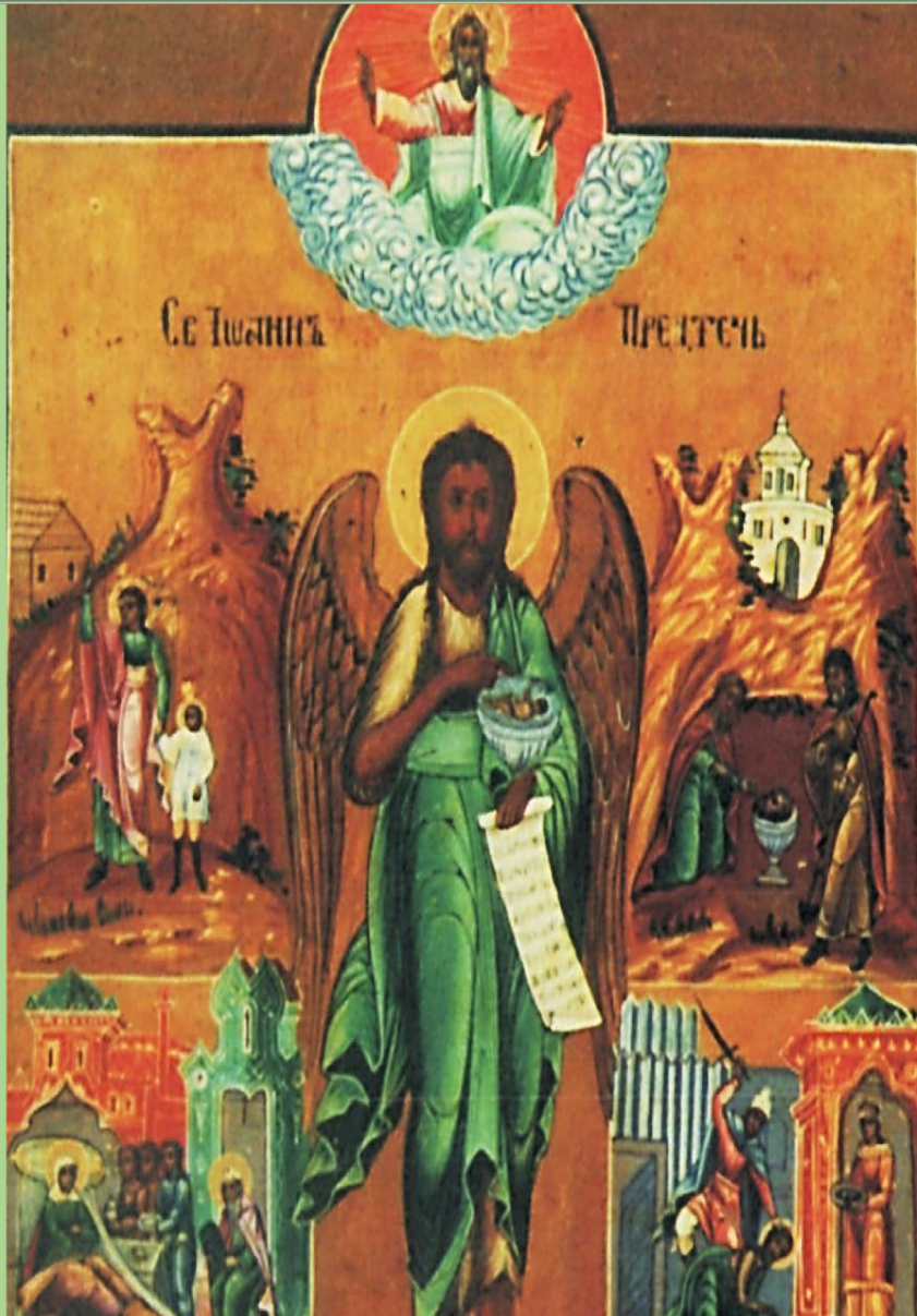
Icon of Saint John the Baptist – August 29th